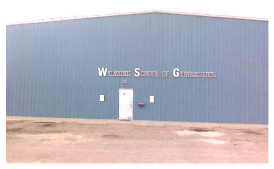
Creating a safe place to learn.